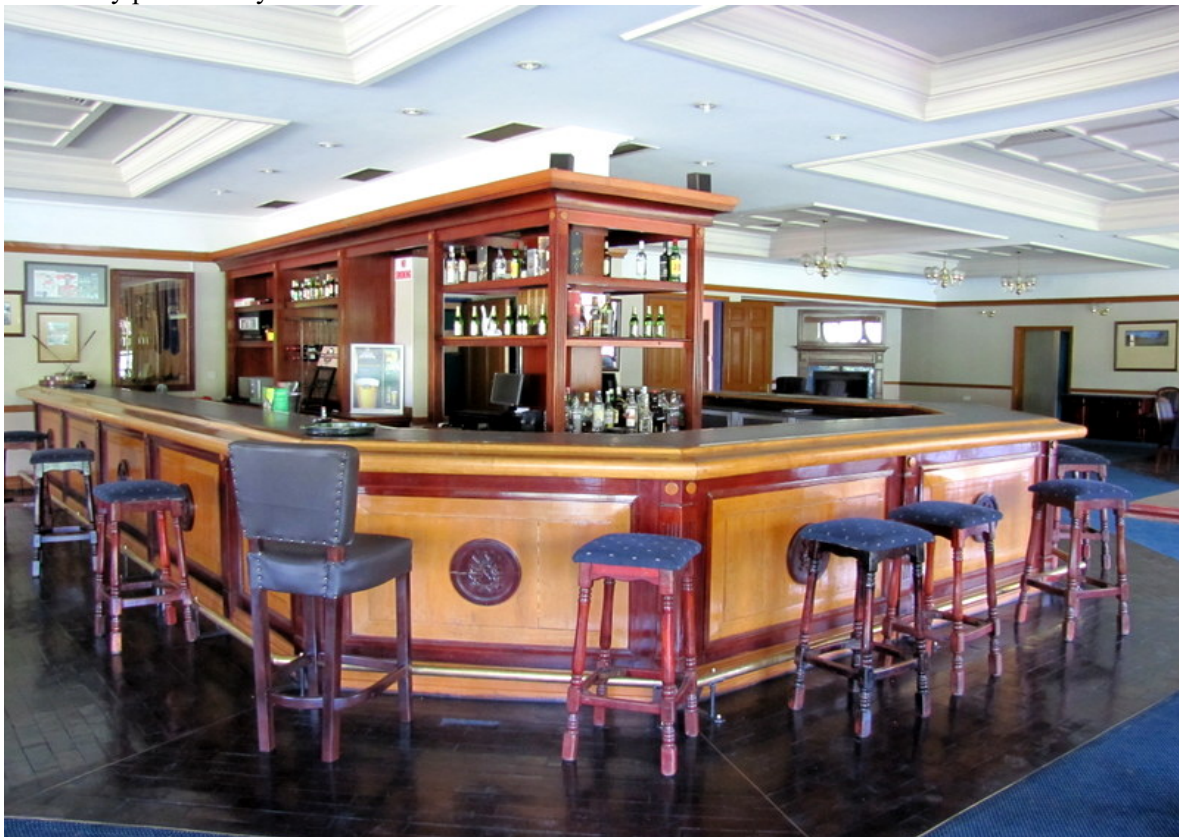
CHAPMAN MEMBERS BAR

As we approach October which is accustomed with heat waves Chapman boasts of having one of the best 19 th hole with all refreshing beverages you can think of to cool you down after a round of golf and excellently provided by our service staff.