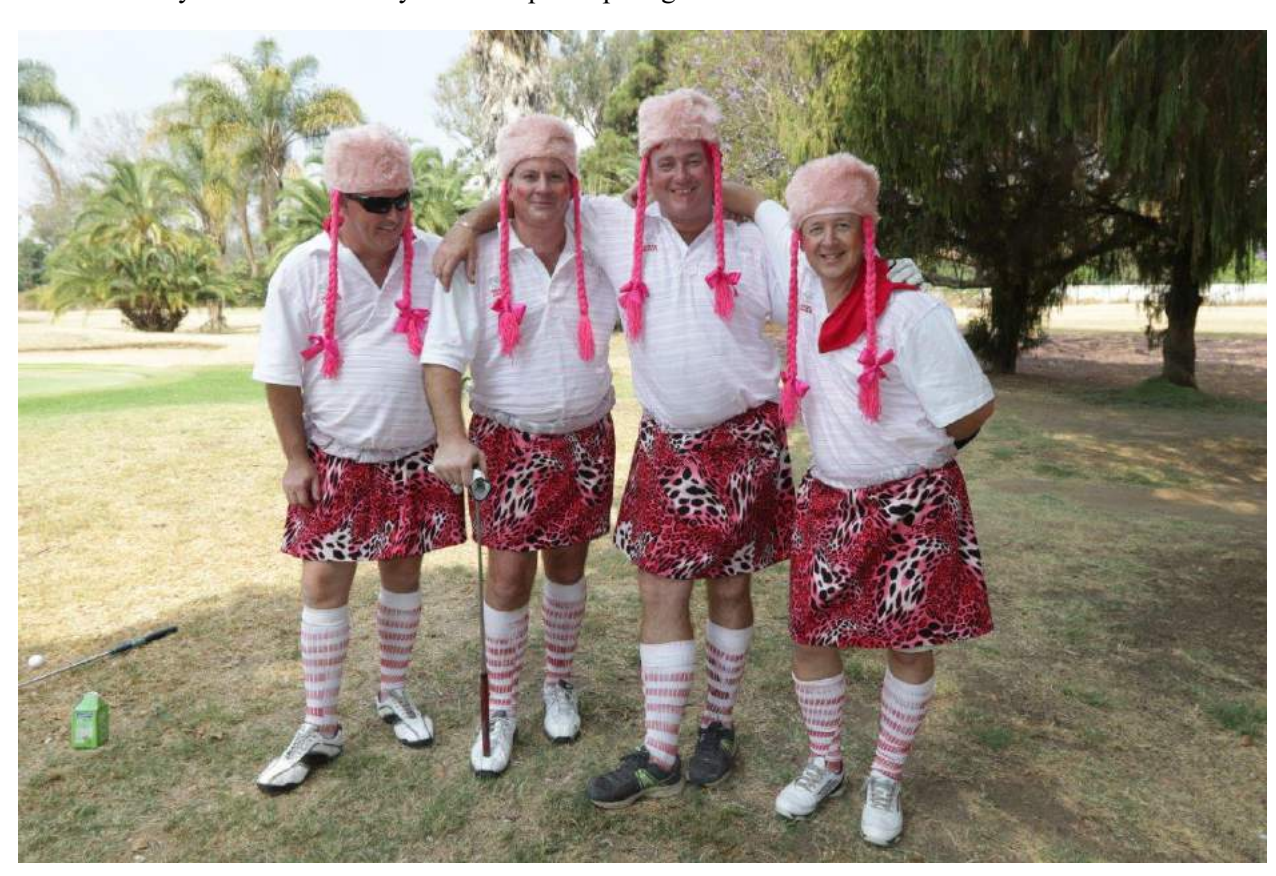
ONE OF THE TEAMS ON THE THINK PINK GOLF DAY

This October broke the hot temperatures record and the golfers were not spared either from this heat conditions. The Golf Course also felt the high temperatures too but that did not deter our committed members from enjoying their game of golf. October is CANCER AWARENESS month and your club successfully hosted the annual Think Pink Golf Day with over 200 players all in support of a worthy cause what day it was and thank you all for participating.