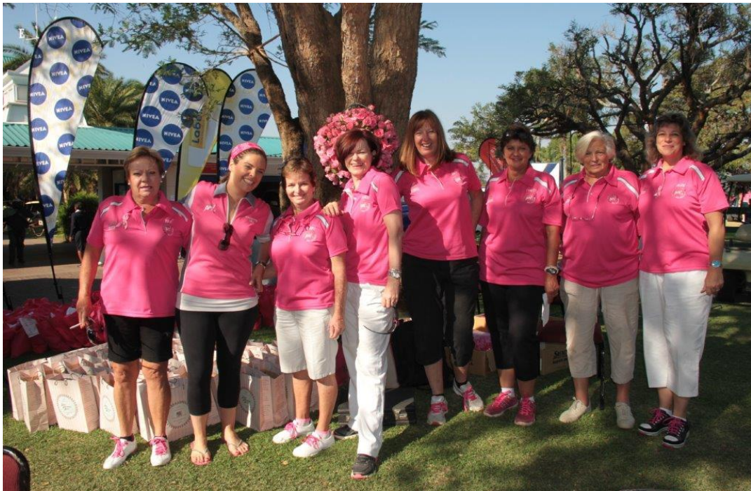
The Think Pink Team