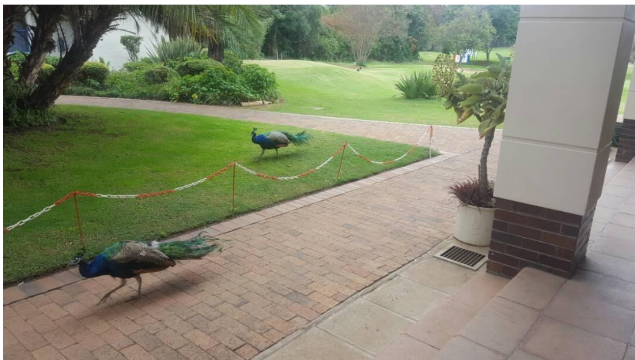
Rare Visitors Peacocks Chapman is becoming popular with wildlife

Club Championships are played in the month of May and they bring a lot of excitement to all Club Members. The course was equally prepared to match this major Club event and congratulations to those who won and to the rest better luck next year. As we move into winter the greens are starting to take hold and have produced a much better playing surface.