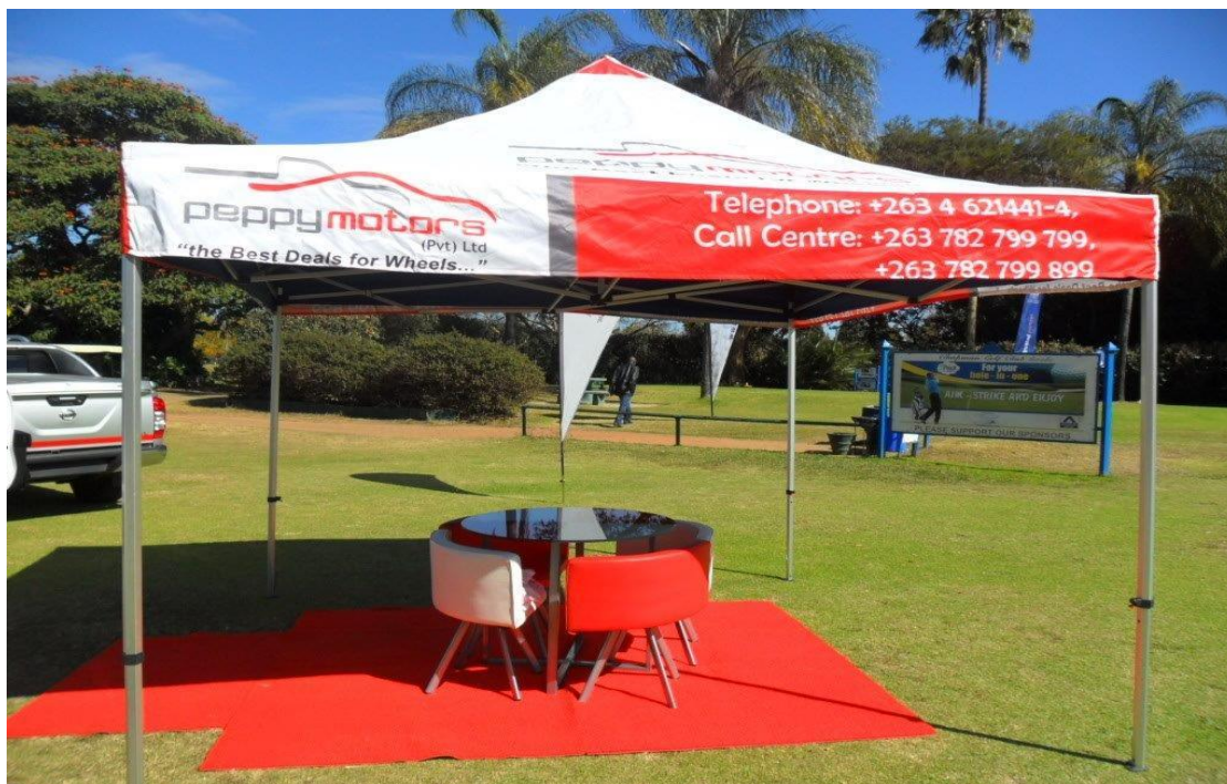
One of the many sponsors for the fundraiser

Regardless of the harsh climatic fluctuations, the month of June ushered a lot of activities at the club from corporate golf days, cocktails, business meetings and not forgetting the best of them all, the Annual Fundraising Golf Day.