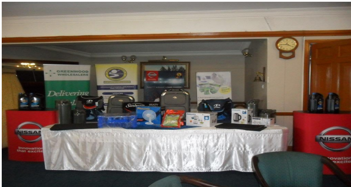
Annual Fundraising Golf Prize Table