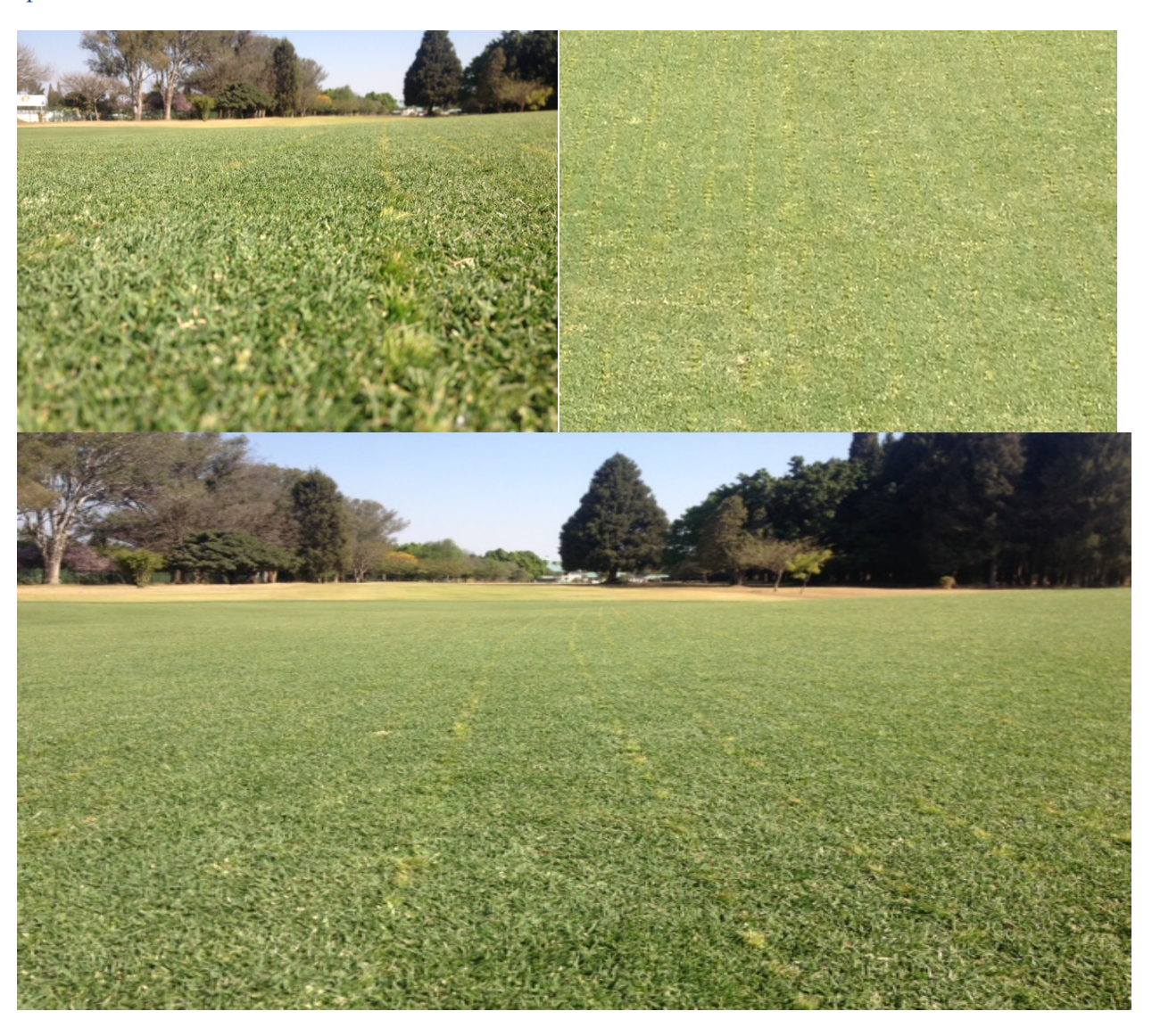
January 2019 brings about many Rule Changes...Your Golf admin and H&C Committee will endeavor to keep you abreast of all the changes. You can as well look in the F2G in the newsletter column for regular rules and Tit Bits on Golfing situations and questions so related.