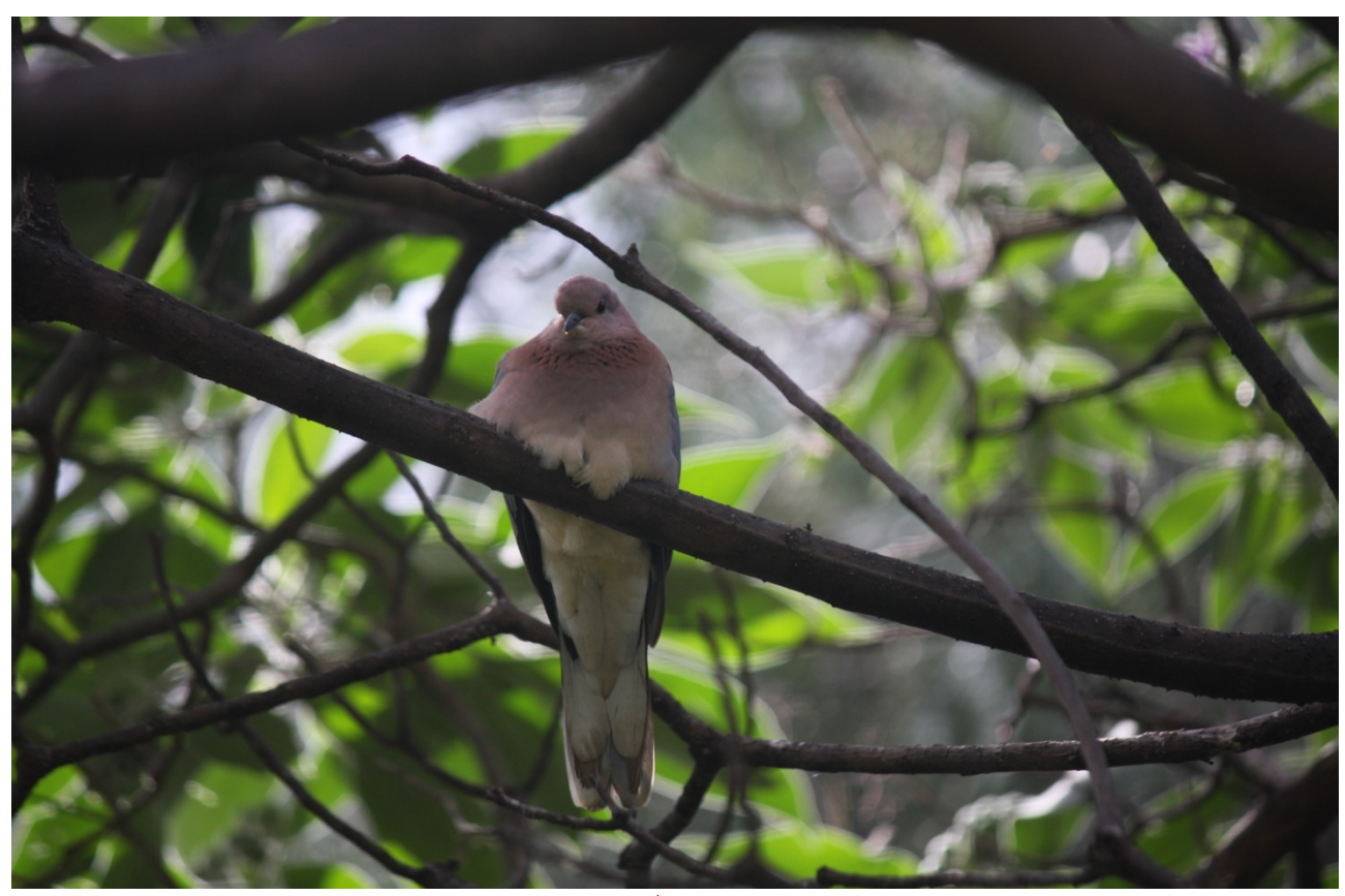
LAUGHING DOYE (SPILOPELIA)

Spring is in the air though we still experiencing cold weathers in the morning and at night. The past month has been delightful for the Club as it ushered in a whole lot of activities and Golf days. We hope to see more of these as we enter the warmer months. Join us this September for a round of golf and enjoy the exciting experience on the beautiful green golf course