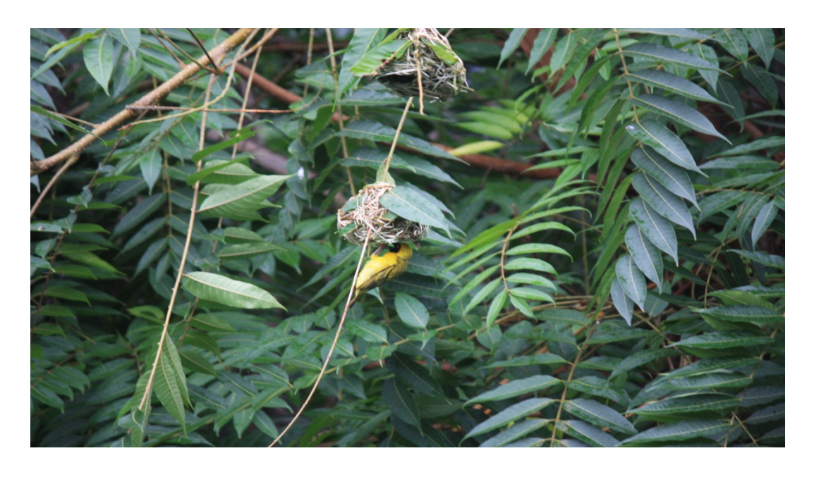
MASKED WEAVER (PLOCEUS)